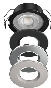
Additional Bezel Finishes (order separately)