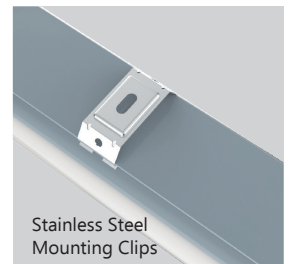
Stainless Steel Mounting Clips