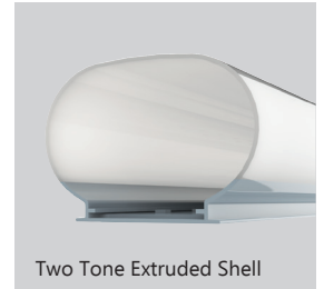
Two Tone Extruded Shell